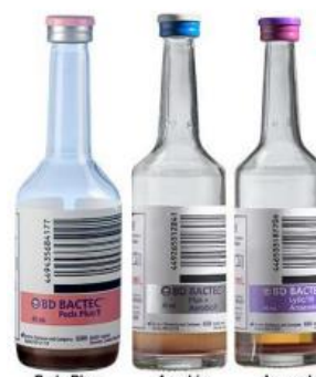
Peds Plus Aerobic Anaerobic